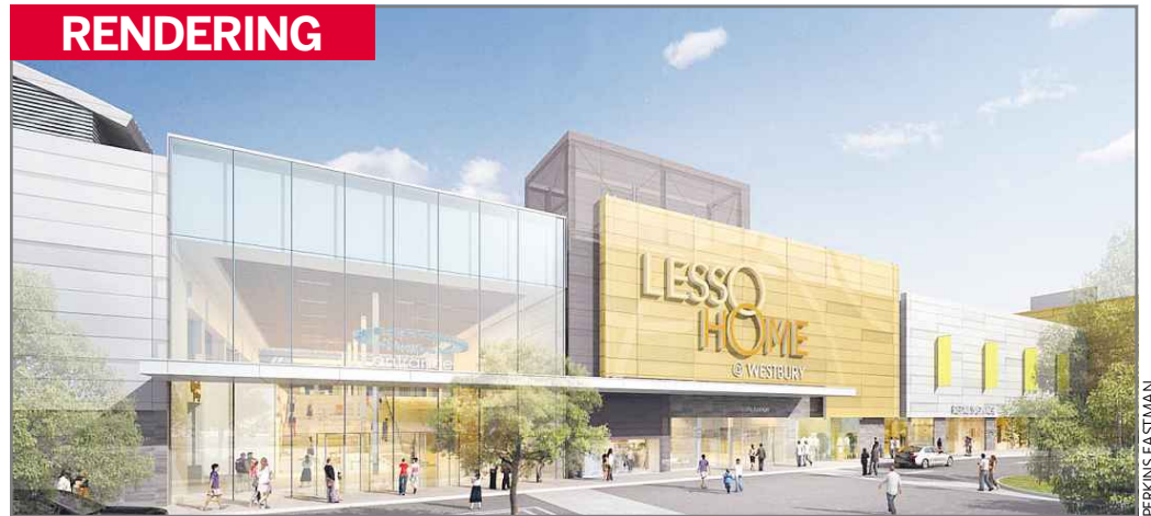
Lesso Mall Development Long Island's project will include three entrances.